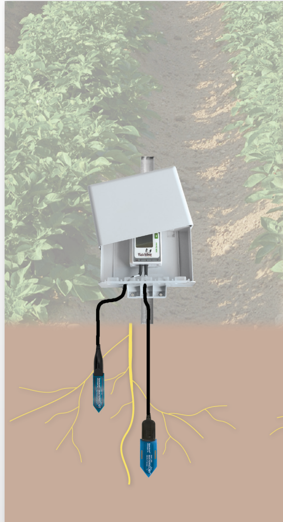
WatchDog 1000 Series Micro Station shown with one WaterScout SM 100 Sensor and one SMEC 300 sensor.

You can collect data and log results when the WaterScout SMEC 300 Sensor is connected to a WatchDog Station.